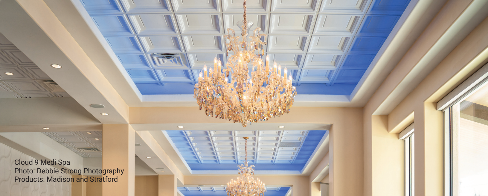
Cloud 9 Medi Spa Products: Madison and Stratford