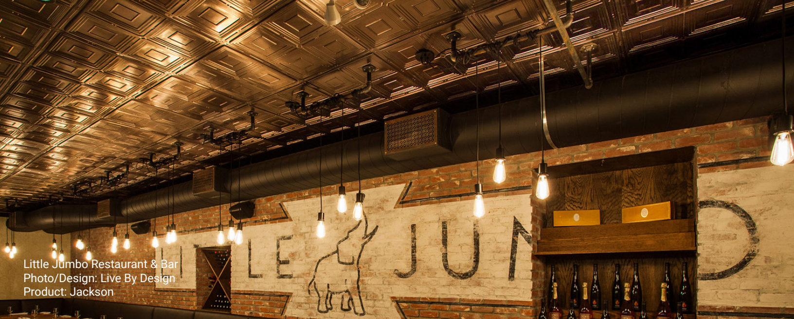
Little Jumbo Restaurant & Bar Photo/Design: Live By Design Product: Jackson