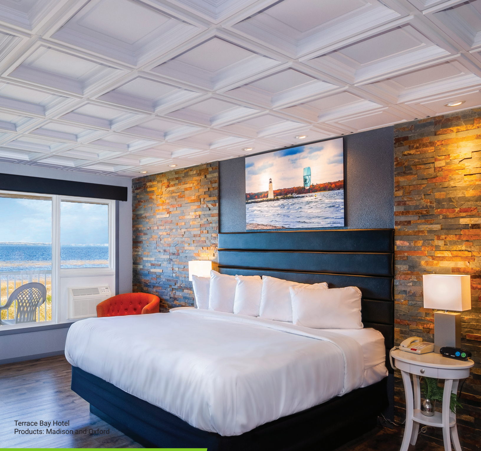
Terrace Bay Hotel Products: Madison and Oxford